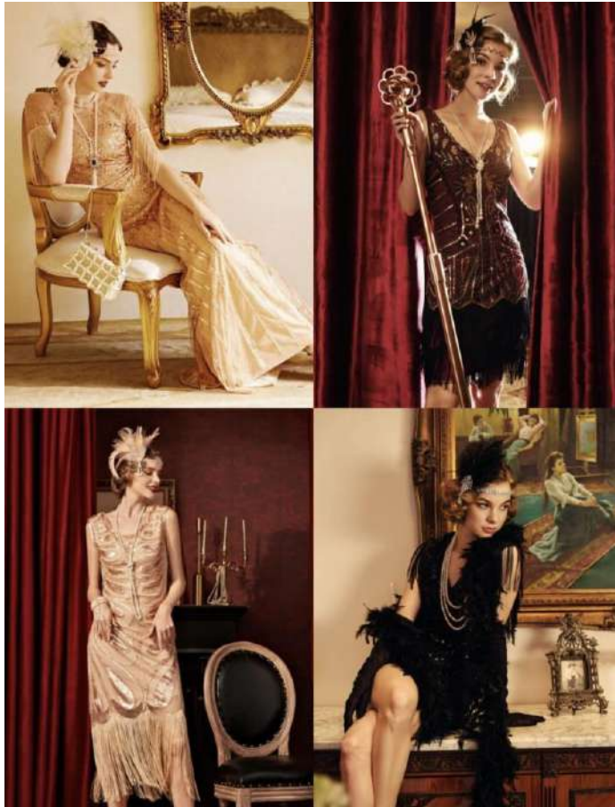
— From @babeyond_officia